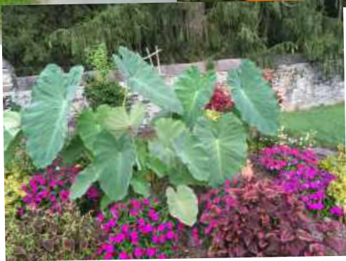
OUR BEAUTIFUL GROUNDS