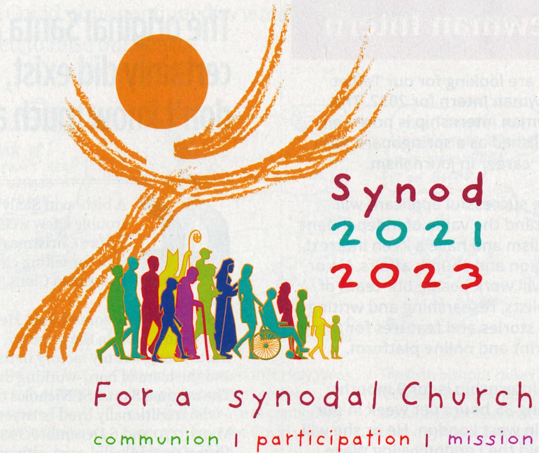
The official logo for the XVI Ordinary General Assembly of the Synod of Bishops

To be in relationship with our neighbours, we must be at home together. But the declining Church has fallen out of relationship with large parts of the population. In particular, too much of the Church in Britain, like too much of our politics, has suffered from middle class dominance. When we welcome diversity, we must include class. Otherwise we will draw the wrong conclusions. When we hear Pope Francis call for a “poor Church for and of the poor”, we must remember that “the poor” means not only the destitute but also working class communities, which include many ethnicities and political opinions. Francis is right to insist that the Church needs to be evangelized by the poor. To be receptive to that evangelizing, middle class Catholics need to be open to building the common good with people from different educational and socio-economic backgrounds, and resist temptations to dominate the space.